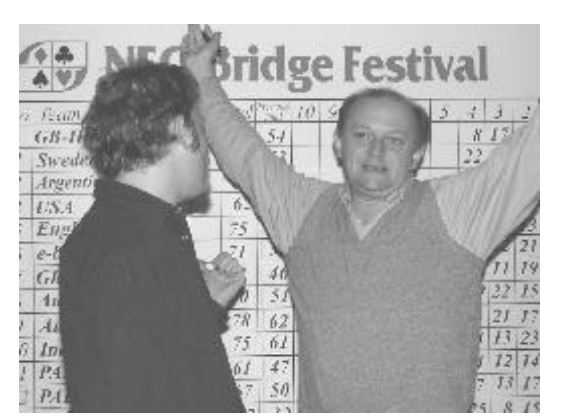
"Is this going to be another one of those 'the one that got away' stories?"

In the Open Room Papa's 1NT was 14-16, 29