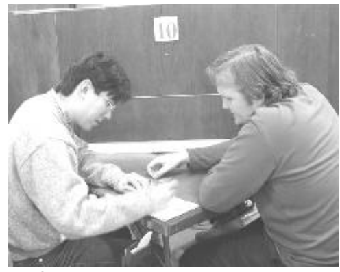
"See, here's mathematical proof the Precision is superior to Moscito."

Manoppo decided to focus on hearts and opted for a self-supporting splinter 4♣ on the second round. That buried diamonds, which wasjust as well on this combination, but would have led to South declaring a heart slam, with a spade lead due to set it. Lasut, with a horrible hand on the auction signed off and Manoppo respected that decision. After the lead of the ♣J, Lasut lost a spade and a club for eleven tricks: plus 650. 13 IMPs to Indonesia, ahead now, 60-47.