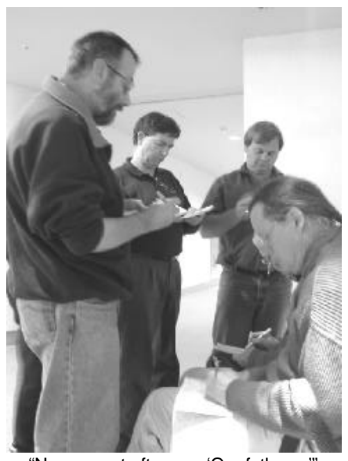
"Now repeat after me. 'Our father..."

Panelewen's four-three 1♠ was a decent contract. Ravenna led the ♠K, reasonably enough, trying to cut down a possible scramble. Declarer took seven tricks for plus 80.