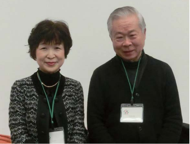
JCBL Cup Winners