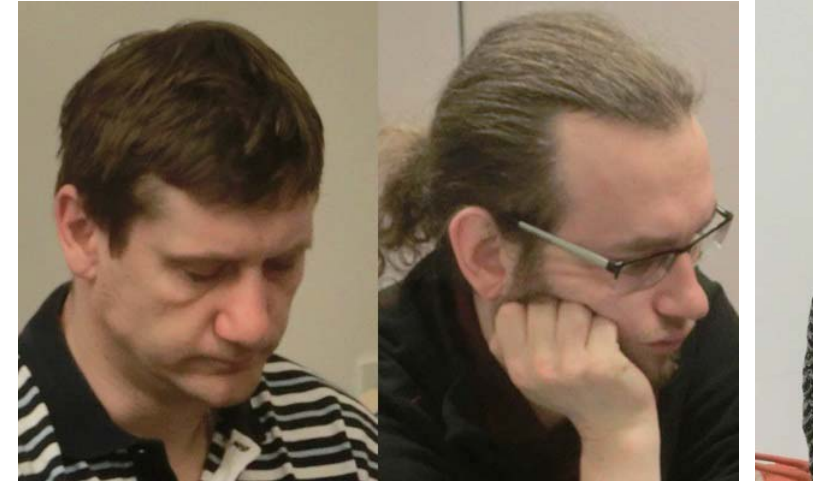
Asuka Cup Winners