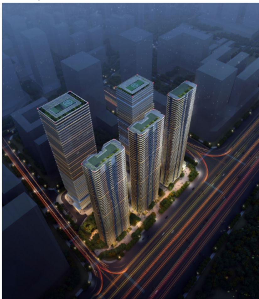
Hangzhou Qi-yuan (Zhili) Chess Hall