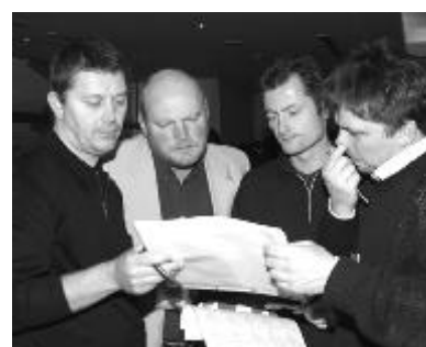
"Yes, that was a smelly result."

3NT needs the diamond finesse and one of the minors to play for four tricks, or a second spade trick. It's sensible to bid it, even non-vulnerable, and indeed, it seems normal to do so. Had Sakamoto rebid 1NT, she would have accepted Nishida's invitational raise. Both Paul's 3NT and Sakamoto's 3♣ produced 10 tricks, +430 and +130, respectively. 7 IMPs to Mavromichalis, 26-11.