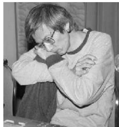
"I had a difficult childhood."