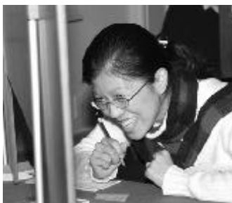
"See, I told you he'd go down if I doubled."