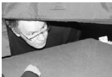
"Selma, where are the car keys?"