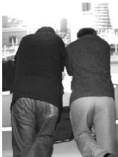
"Oops, no bounce."