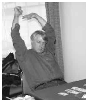
"I owe it all to yoga."

Groetheim led a club around to the queen, took the ♣K with the ace, and switched to a low heart. Gawrys, who needed to gain the lead, called for the king, and was able to knock out the ♦K for +90, reclaiming the lead with a 4-IMP gain, 31-30.