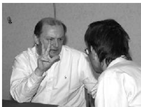
"I said I had two Key Cards."