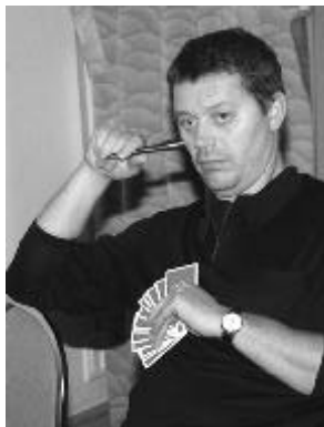
"I ask you—am I not brilliant?"