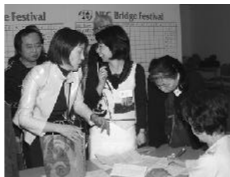
"Gee, we're sitting with the Schwartz's."