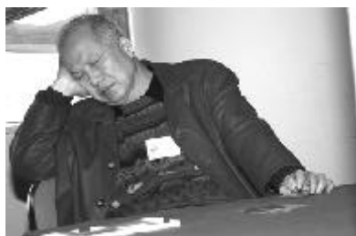
"I don't think I would have made it even if I was awake."