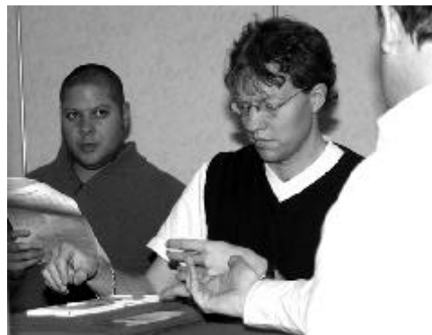
"I'm sure this is the guy who robbed the candy store."

When 2♥ made two at the other table Sweden had turned a 4-IMP gain into a push. Sweden still ahead by 3-0.