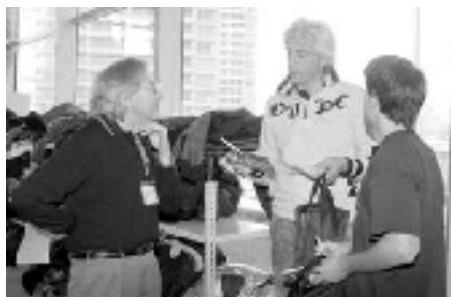
"We could go to the Ginza. I read there's a sale on Italian shoes."