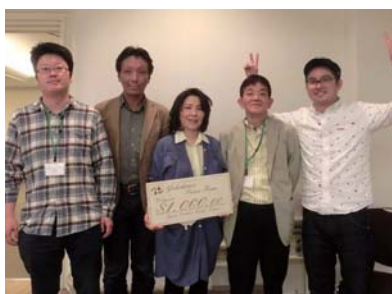
Yokohama Swiss Winners