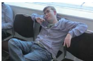
King of Yokohama