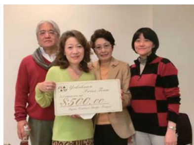
Yokohama Swiss 2 nd Place