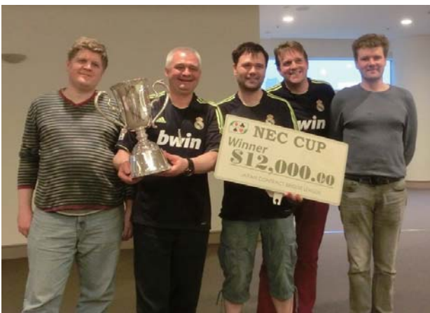
2013 NEC Cup Champions: Russia