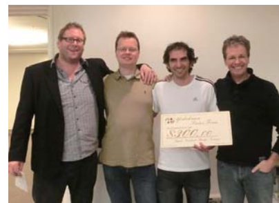
Yokohama Swiss 3 rd Place