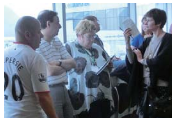
"So, you girls up for a party later?"

While Russia had had some good fortune at a few critical moments, they had played exceptionally well throughout the knock-out stage, conceding fewer than 1.5imps per board (165 in 112 deals). Mixed also played their part and would not be disgraced.