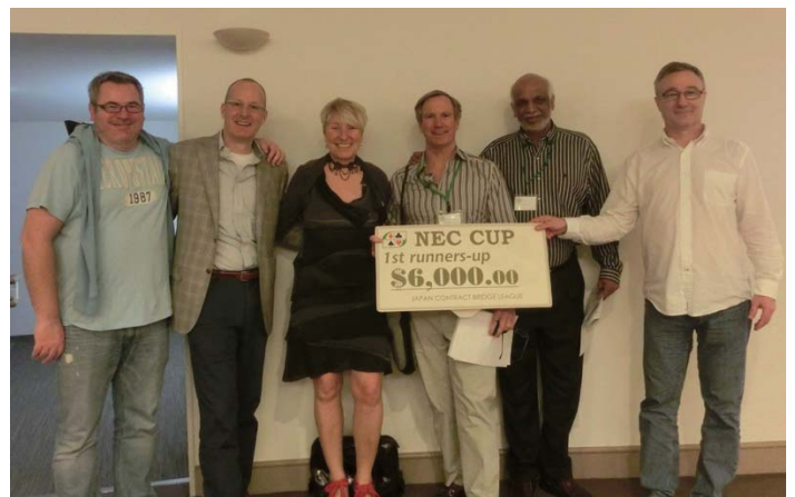
2013 NEC Cup Runners Up: Mixed