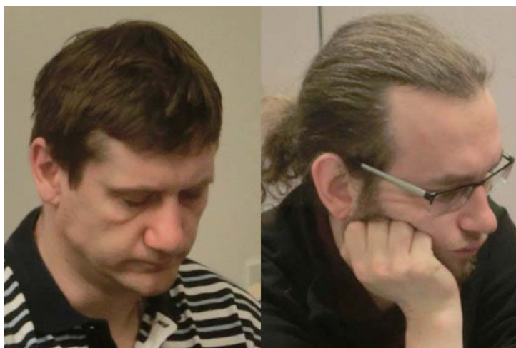
Asuka Cup Winners