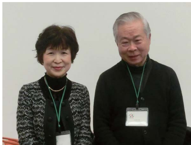
JCBL Cup Winners