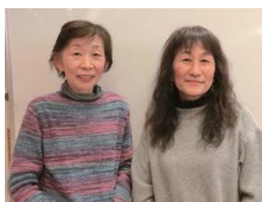
Beginners Cup (-5): 1 st