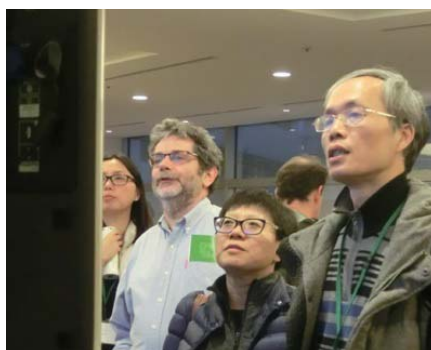
"Wait. Is this that new Lotto thing?"