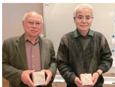
Beginners Cup (-20): 1 st