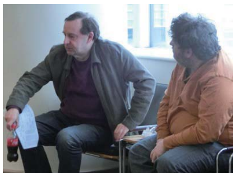
"Don't go away mad...Just go away!"