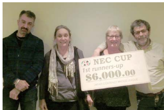
2017 NEC Cup Runners-up: England/USA