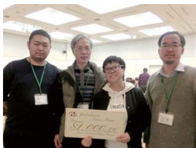
Yokohama Swiss teams: 1 st