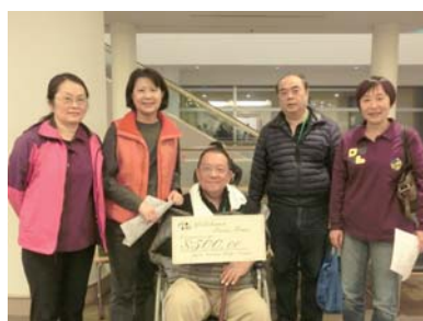
Yokohama Swiss teams: 2 nd