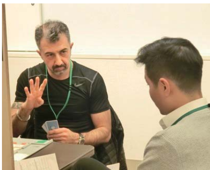
"How many fingers am I holding up?"

Sometimes I sit quietly and wonder why I'm not in a mental asylum...then I take a look around and realize, maybe I already am.