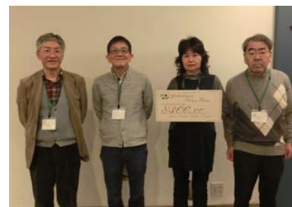
Yokohama Swiss teams: 3 rd