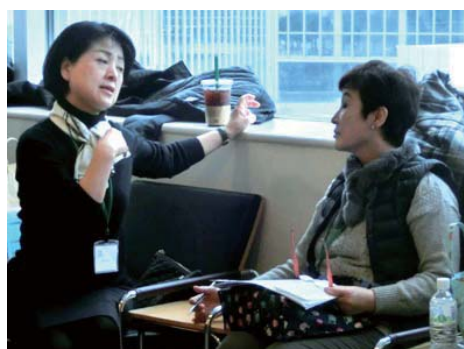
"It's new. It's called an air violin."