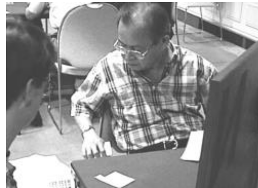
“It says here that he should have two seven-card suits, 3-6 or 8-11 HCP, both majors or both minors and three controls — unless this month has an “R” in it.”

If you’re willing to bid a slam like 6♣ on that one, why not 6♥ or 6♦ on this layout? Key cards, schmee cards? Sure, if you use RKCB, you’ll discover that you’re missing two of the little devils, but I once remember bidding a slam without using Blackwood. I’m not suggesting that you should bid this one; you shouldn’t. But it’s a better slam than so many of the others we’ve seen. There were no takers this time. I shudder to note that one of my favorite Indonesian pairs played these cards in 3NT.