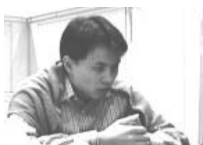
"How can I get RHO to underlead his ♥A?"