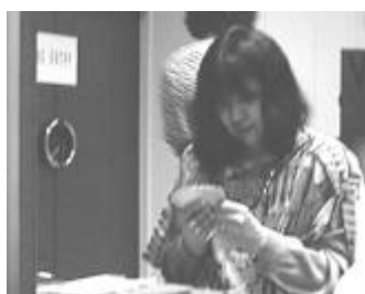
"I'm tougher than I look."

There was, however, one match in which both tables reached the six-level. WC Li-CC Cheung for Hong Kong Youth reached 6♥ doubled, but the board was flat when Eric and Jim Wu for Chinese Taipei reached 6♦ doubled and were perhaps a bit unlucky to fail.