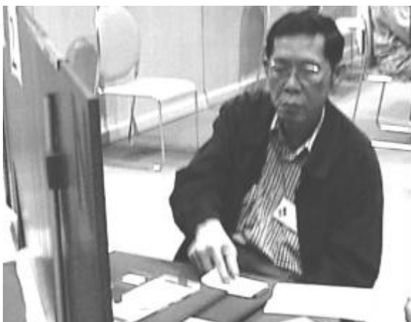
"Bid 'em up."