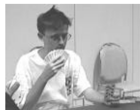
"The Beer Card. Why me?"

The same pair of results was recorded in China vs Indonesia, with Indonesia recording the two pluses. Nevertheless, they lost the match 14-16.