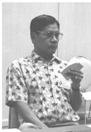
“Twenty-one, twenty-two ...”