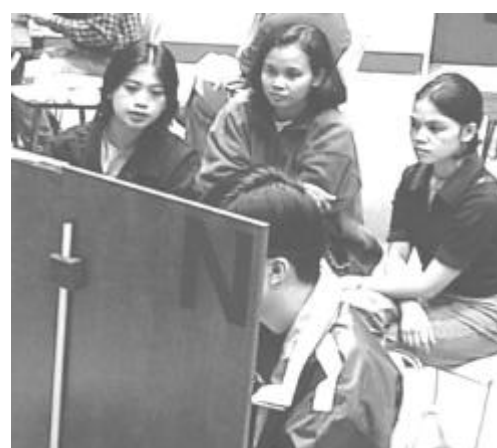
How do you spell F-A-N C-L-U-B?

As Winston Churchill might not have said . . . “This was their finest hour.”